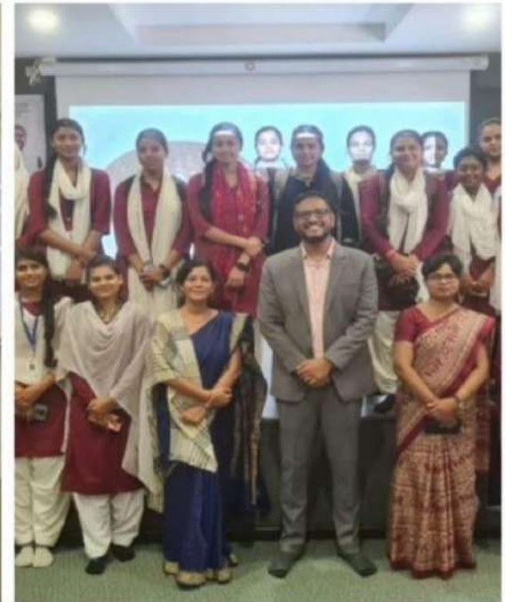
Two days Mentor training programme conducted by BIS