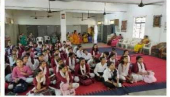
Fashion designing, office management and computer based training by ITI, Bhopal