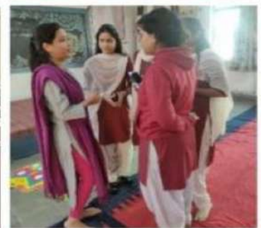
Career guidance by Fledge Institute of Aviation , Bhopal